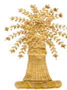
St Francis School